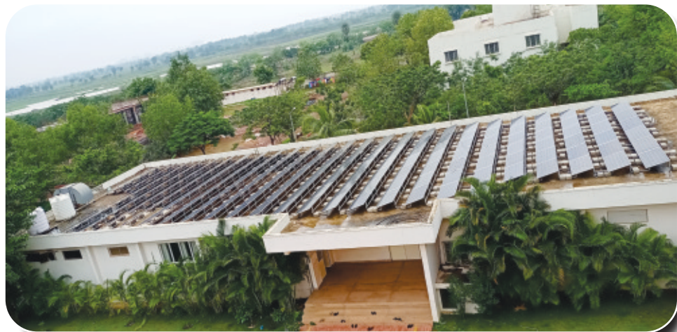
500 kWp Grid-Connected SPV Power Plant at Sri Sathya Sai Sanjeevani Hospital, Naya Raipur

MD REIL addressed the audience and made a presentation on Opportunities for solar equipment manufacturing in Rajasthan in a virtual conference on Rajasthan-Destination Renewable Energy Equipment manufacturing organized by CII, RIICO and RRECL on 27.04.2021. While focusing on PLI scheme and Rajasthan Solar Energy policy 2019, he also shared the potential and opportunities available in Rajasthan for manufacturing of different solar components and suggested ways to establish the state of Rajasthan as a leader in domestic manufacturing of Solar Equipment's.