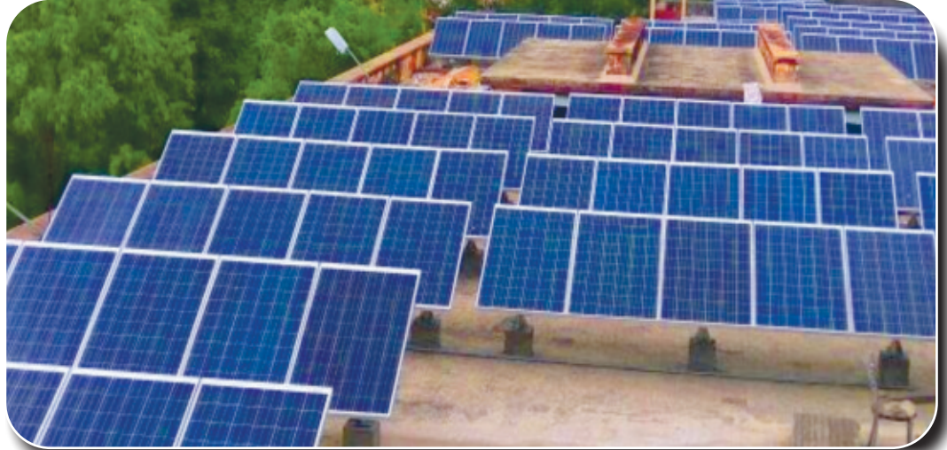
30 kWp Grid-Connected Rooftop SPV Power Plant at REIL House

The Company has installed 30 kWp Grid-connected Roof Top Solar Power Plant at REIL House, Mansarovar, Jaipur in order to comply with the terms of 3-Star GRIHA rating and to realize the social and economic advantages of Solar Power Plant. The 30 kWp plant installed is directly connected to the grid and shall generate approx. 45000 units of electricity per annum, with saving of Rs. 4.30 lakh and conserving environment from 42 tons equivalent of harmful carbon emissions per year.