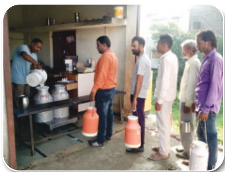
Milk Collection at Central Region

REIL tends to understand customer's needs and bring them ease by doing innovation in the current solutions and adding more features persistently. For the first time ever, REIL is to deploy Cloud based Online Milk Procurement Solution / program for DCS & BMC Center (Real time) along with SMS/Mobile Application with 5-year maintenance as per billing process of average milk collection per month. This system will upgrade & connect approximately 800 Nos. of DCS/MCC online and will provide Real time milk collection data. Such initiatives definitely will lead to great transparency for farmers and big boom in future business volume while aligning with the Digital India Mission.